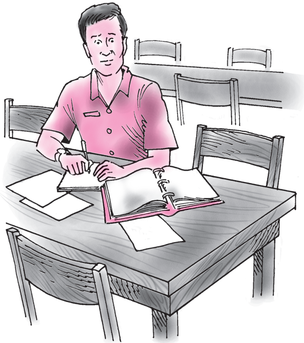
FIGURE 4-2 ■ It is the responsibility of all therapists to know what laws, rules, regulations, and ordinances apply to their practice.

everyone follows all the appropriate guidelines. When in doubt, ask. If you are the first therapist in your community, don't be surprised if your city officials are unsure about appropriate guidelines for massage therapists. In this case, you may need to meet with the officials to help create guidelines for your community. Find ordinances and regulations from other communities to help the process along. Be patient, and remember the person you are talking to may become a client or someone who tells other people about your new practice.