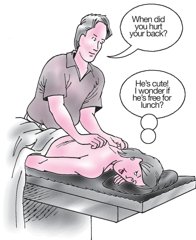
FIGURE 7-2 ■ The effects of a gentle touch may lead a client to feel attracted to a therapist. The therapist needs to be aware of the client's response and adjust the technique accordingly.

A more problematic issue occurs when a client is sexually attracted to a therapist. This may be a natural attraction or the result of transference. The transference of a feeling for another person or the effects of a gentle, nurturing touch could lead a client to feel attracted to a therapist (Fig. 7-2). The client may reveal his or her feelings through subtle or sometimes blatant remarks or movements. Once the therapist is aware of this happening, a change of the routine or techniques may prevent the problem. But if the client continues to show an attraction to the therapist, it is appropriate to talk with the client and suggest a referral to another therapist. Because the therapist and client are alone in a room together in most cases, it is imperative to take precautions to prevent any improprieties from happening. Improprieties include a client making a sexual suggestion or comment, touching the therapist, or making any type of advance.