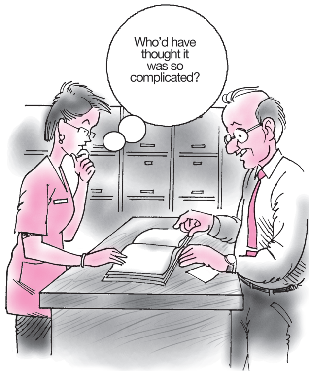
FIGURE 4-1 ■ A new therapist should research local ordinances that apply to her business.

It is the responsibility of all massage therapists to become educated in legal matters and understand what laws, rules, regulations, and ordinances apply to them (Fig. 4-2). It is also important to not interpret any laws, rules, and regulations on your own. When in doubt, ask the people in charge. Talk to your state board or your city government. Students sometimes feel frustrated in having to deal with officials, but this is part of the educational process and there is much to be said for knowing just what you have to do. The Internet is often a valuable resource for getting information and applications when needed. In addition, check with your school and other therapists in your community to see what they have done, but be careful when acting on personal information because not