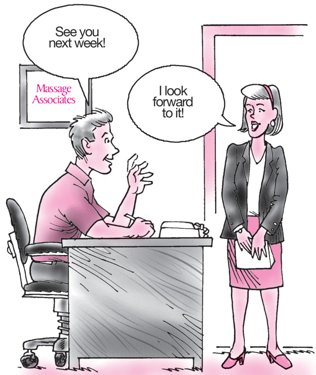
FIGURE 5-2 ■ It is possible to have a pleasant, personable relationship with clients while remaining professional.

trying to focus on your work. If the client still persists, you may have to be more direct and say that you need to focus your attention on the session.