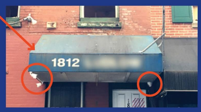
Security-camera surveilled, buzzer-controlled entrance in <u>Philadelphia</u>