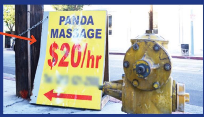
Extremely low prices in Los Angeles